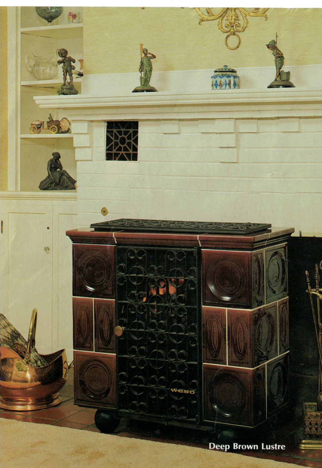
Deep Brown Lustre